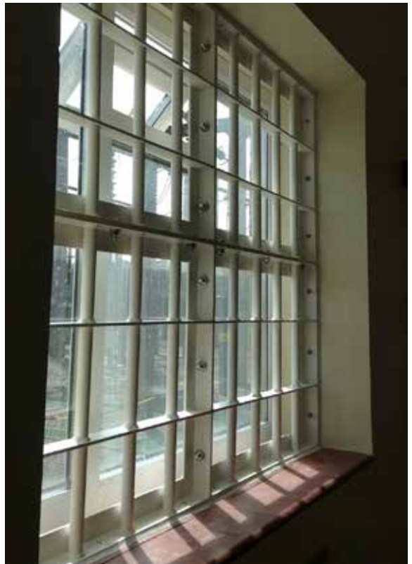
ExcluGrille® 1 to 4

Specialist transport service includes curtain sider lorries with Moffett facility, flat bed lorries with HIAB facility and lightweight vans as applicable.