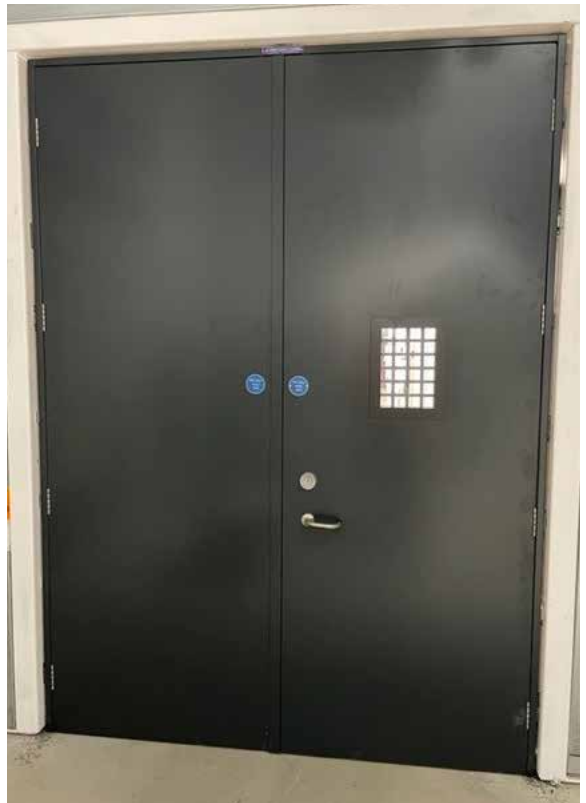
ExcluDoor® 3 FR

Specialist transport service includes curtain sider lorries with Moffett facility, flat bed lorries with HIAB facility and lightweight vans as applicable.