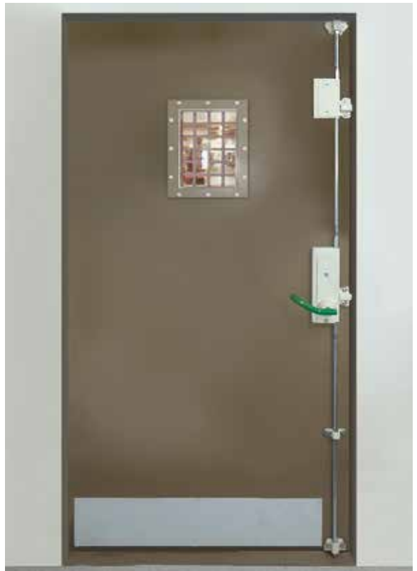
ExcluDoor® 4 FR

Specialist transport service includes curtain sider lorries with Moffett facility, flat bed lorries with HIAB facility and lightweight vans as applicable.