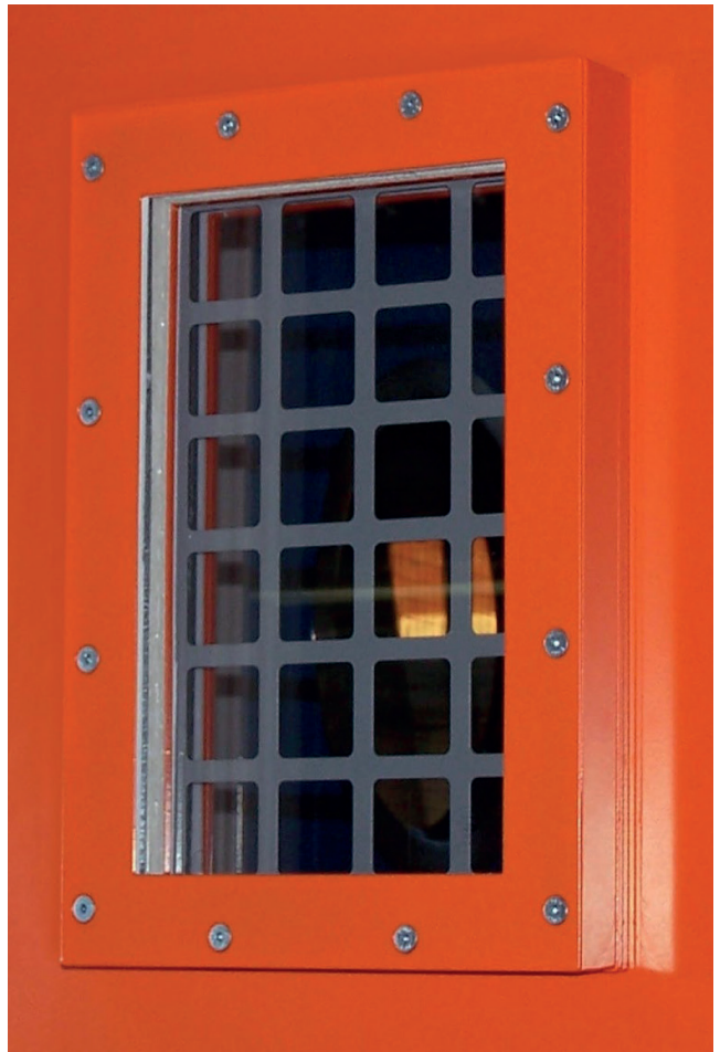
ExcluGlass® 4 FR