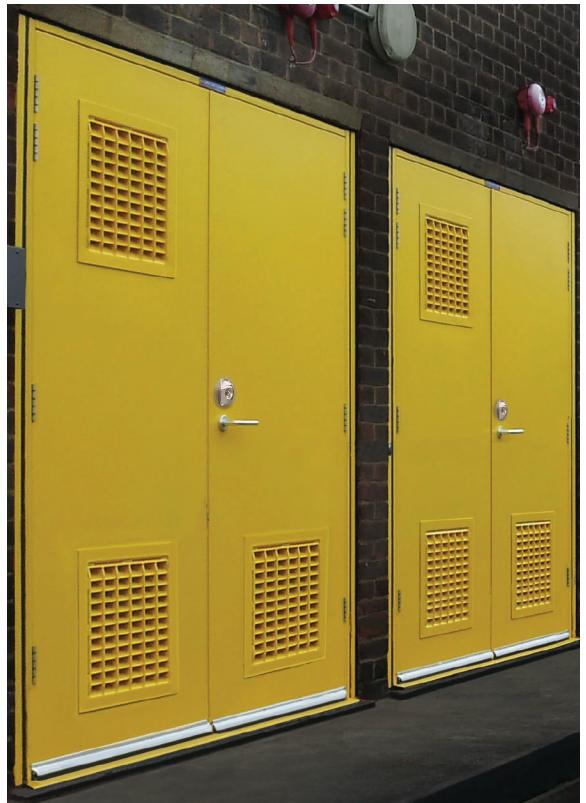
ExcluDoor® 5 double doorsets fitted with ExcluVent® ventilated panels.

Specialist transport service includes curtain sider lorries with Moffett facility, flat bed lorries with HIAB facility and lightweight vans as applicable.