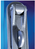
Sunray 6000 Hasp & Staple

Sunray have designed a range of supplementary products to complement their ranges of security and industrial doorsets.