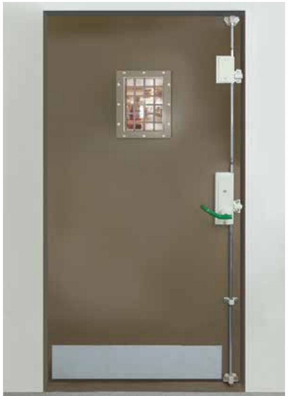
'Extra high' ExcluDoor® 4 incorporating 4-point locking system fitted with kickplate and ExcluGlass® 4 vision panel as extras.

Specialist transport service includes curtain sider lorries with Moffett facility, flat bed lorries with HIAB facility and lightweight vans as applicable.