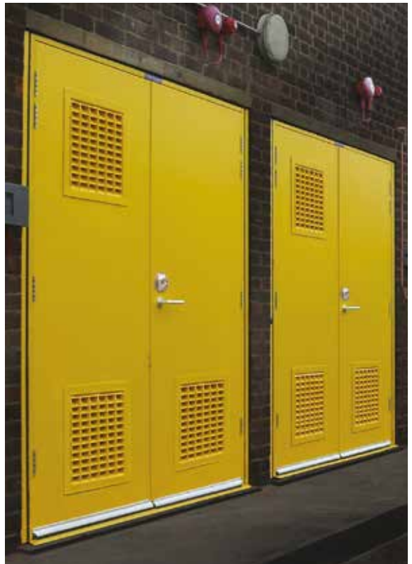
ExcluDoor® 5 double doorsets fitted with ExcluVent® 5 ventilated panels.

Specialist transport service includes curtain sider lorries with Moffett facility, flat bed lorries with HIAB facility and lightweight vans as applicable.