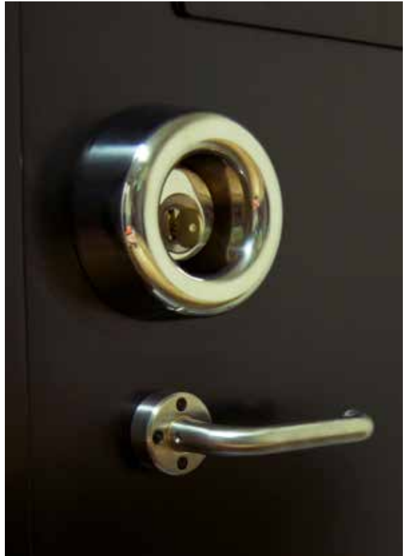
External locking option of lever handle and high security cylinder guard.

Specialist transport service includes curtain sider lorries with Moffett facility, flat bed lorries with HIAB facility and lightweight vans as applicable.